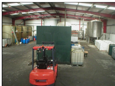
Our new plant

Meanwhile, we are flat out raising finance and working capital – it is an opportunity too good to miss. This purpose built plant has a maximum capacity of 10 million litres/year and will enable us to become a much stronger player to advocate for ethical sustainable biofuels. Surplus profit will be invested in other social enterprises.