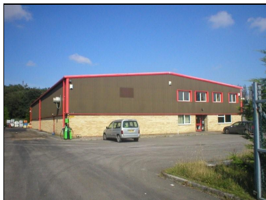
Our new project site!

Hot off the press! Sundance has taken over an existing large scale biodiesel plant in Tredegar that recently went into receivership. With the support of the Good Fuel Co-operative, we have put down a deposit for assets, taken up the tenancy and applied for the transfer of the environmental permit which will take approx 2 months.